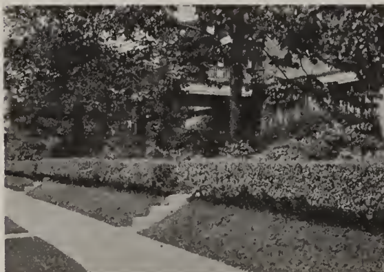
AMUR RIVER PRIVET HEDGE